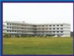
Dr. Rizvi College of Engineering, Karari, Kaushambi