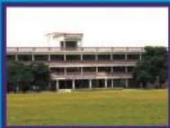
Dr. A.H. Rizvi Degree College, Karari, Kaushambi