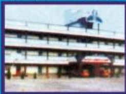
Dr. Rizvi Learner's Academy, Jaunpur